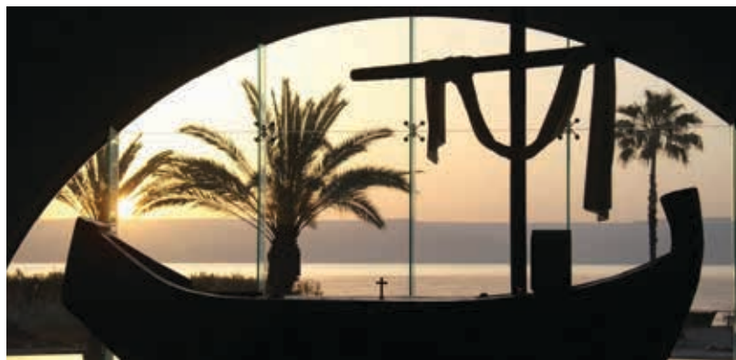
Boat Chapel, Duc In Altum, Magdala, Israel

A STORY FROM MY JOURNEY THROUGH THE "HOLY LAND"